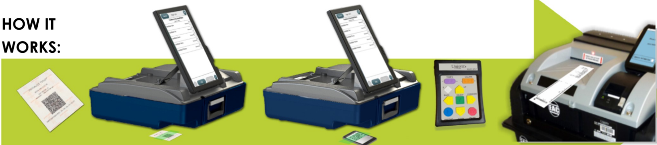
Voter checks-in and receives a barcode from pollbook to initialize their ballot